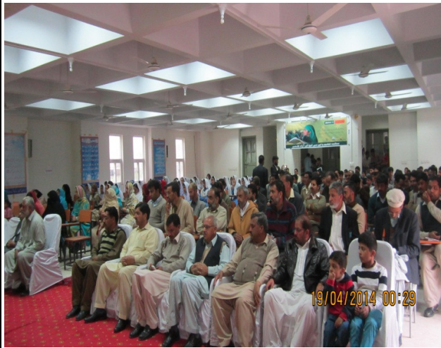
Audience at Inauguration Ceremony