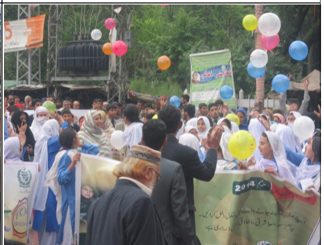
Participants of Walk Releasing Balloons in the air