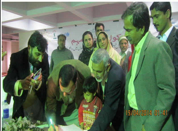
Minister for Education Enrolling a Child