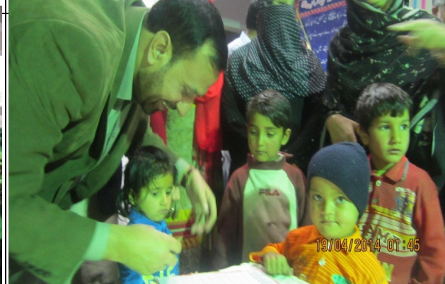
Minister for Education Enrolling Children