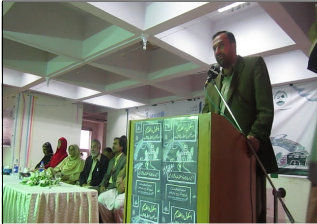
Minister for Education AJ&K Addressing the Audience