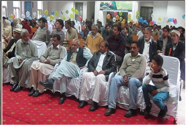
Audience holding the Balloons