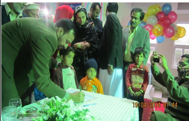
Minister for Education Enrolling another Child