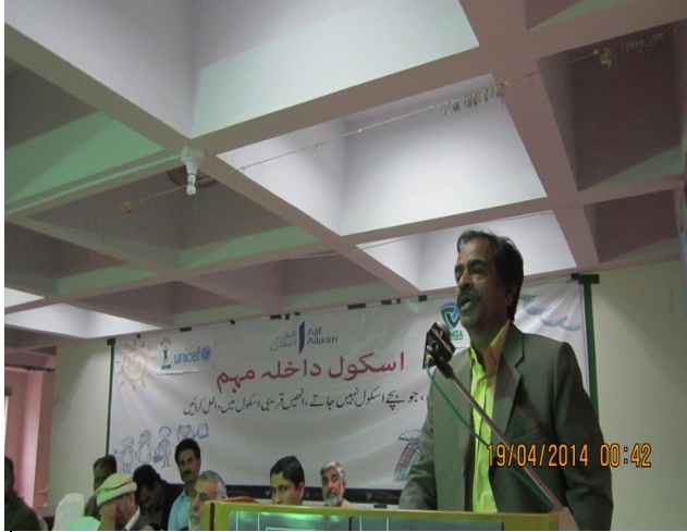
A/SGM AJ&K Addressing the Audience